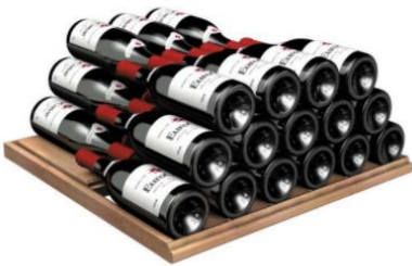
Storage shelf* AXUH