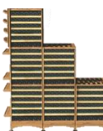
Sloping roof W1842 × D584 × H2008mm