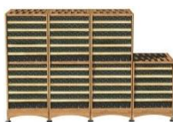
Low ceiling W2426 × H1336 mm