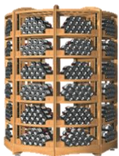
Around a pillar Ø 1800mm H2060mm