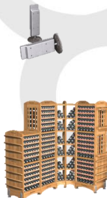
Corner of a room Length 1 st wall section : 2215,7mm Length 2 nd wall section : W1631,7mm × D584 × H2008mm