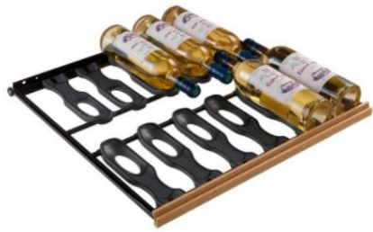
Sliding shelf* MDS L60 ACMS