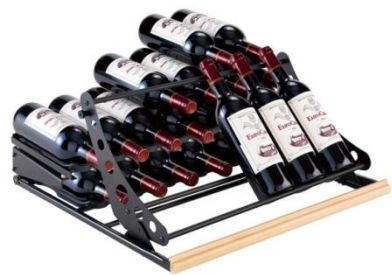
AOPRESAR kit** Compatible with MV1