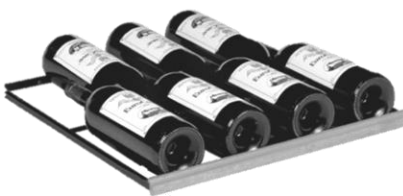
Sliding shelf MDS L40